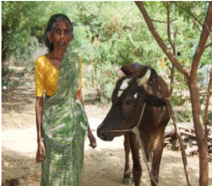
The woman told proudly that the cow gave birth to a female calf a few weeks ago. So, that means that she will have in a few months a double income of milk. The cow was a loan out of the rehabilitation program, monthly she's paying back a small amount.