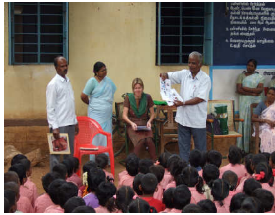
Health & Leprosy Awareness Activities Participated VIP Mrs Agnes Volunteer from Netherlands